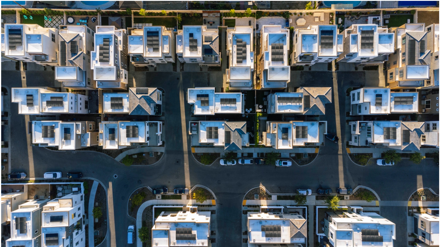
Then rent doubled , 2021 Inkjet print on Archival Paper 17x22in