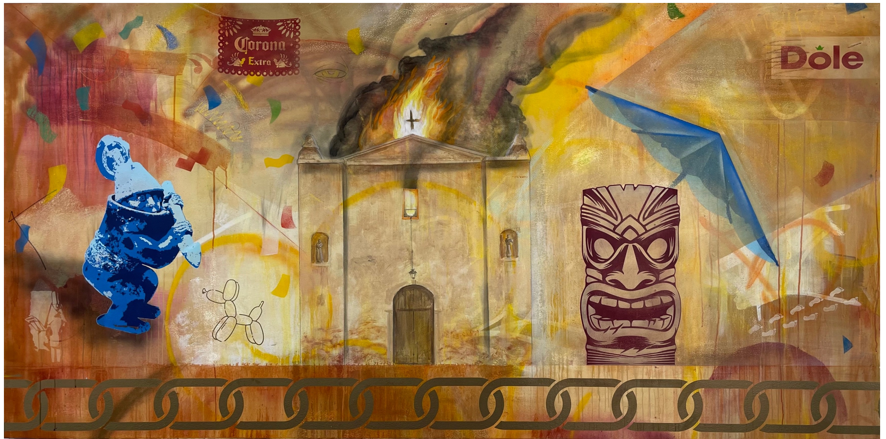
Bueno, Bonito, Barrato 1 , 2021 Mixed media on Panel 96x48in