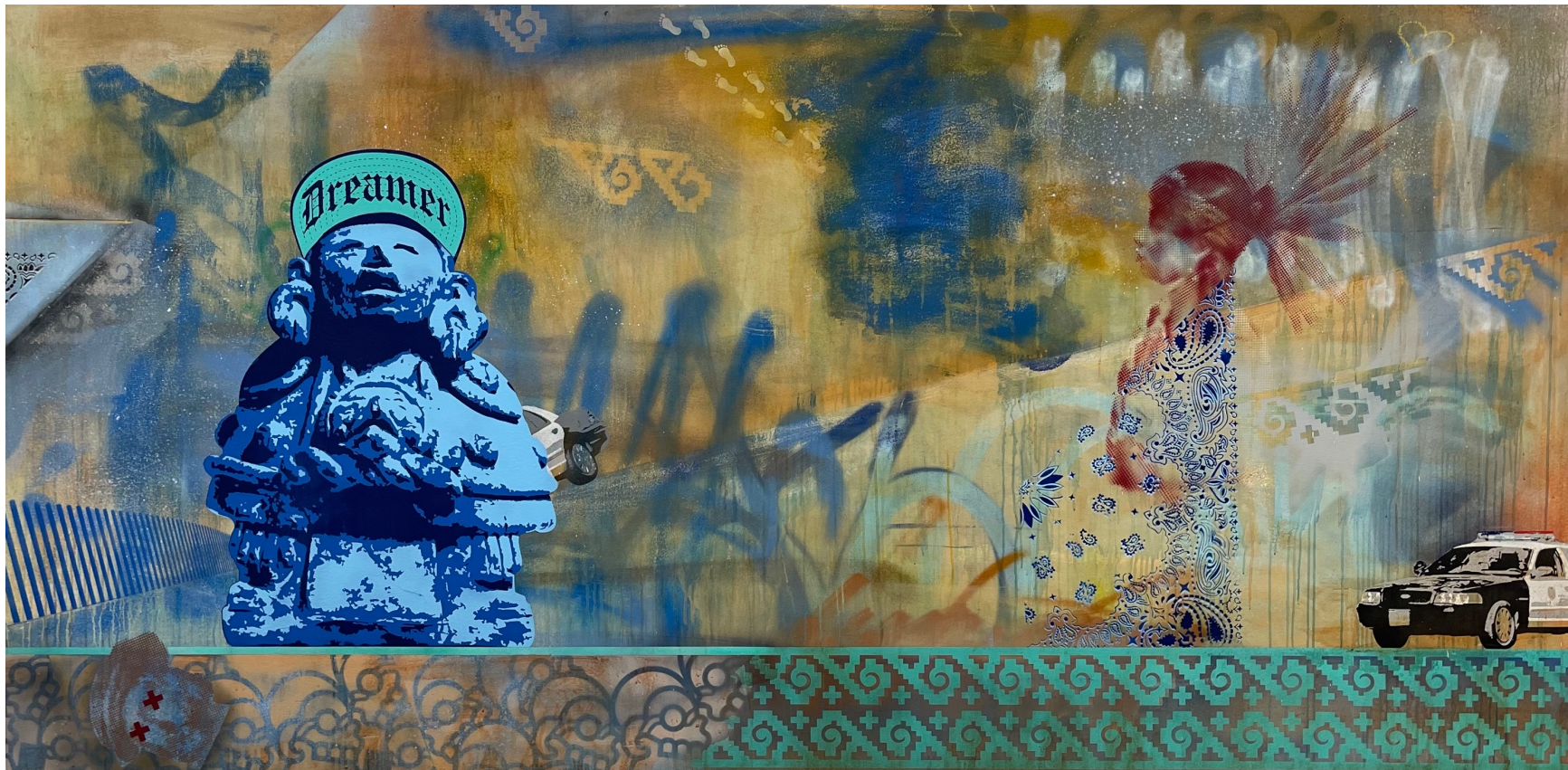
Bueno, Bonito, Barrato 3 , 2021 Mixed media on Panel 96x48in