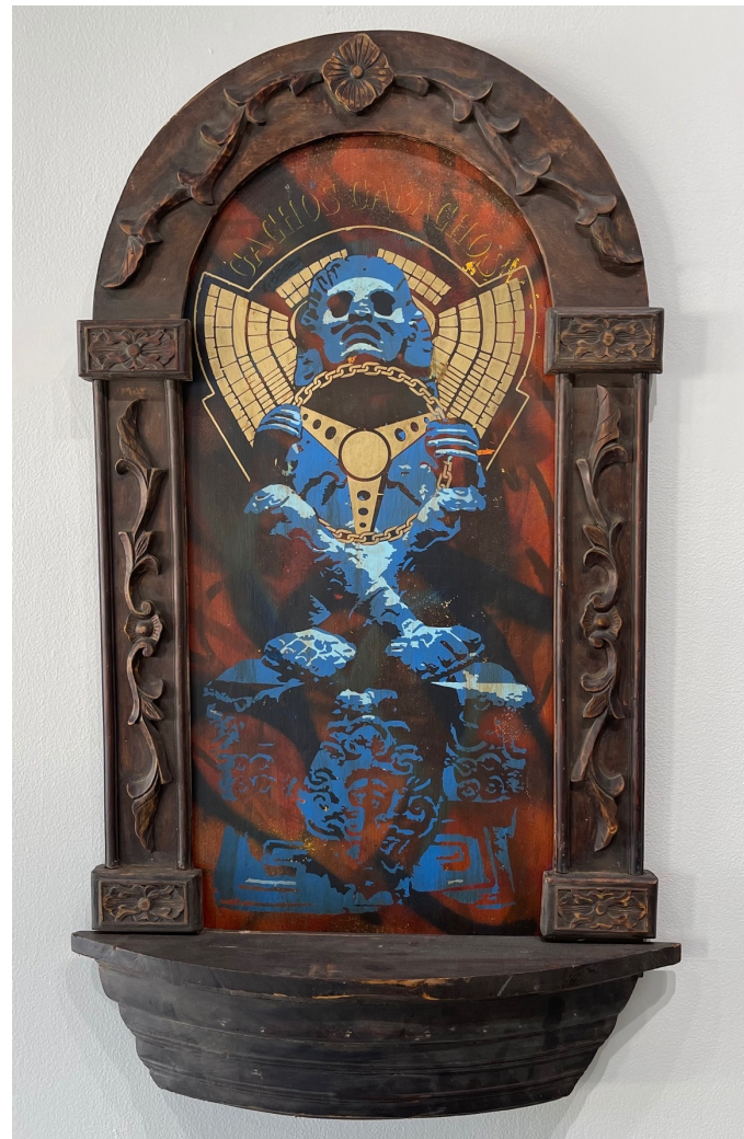
Gachos Gabachos 2021 Mixed Media on Panel 24x41in