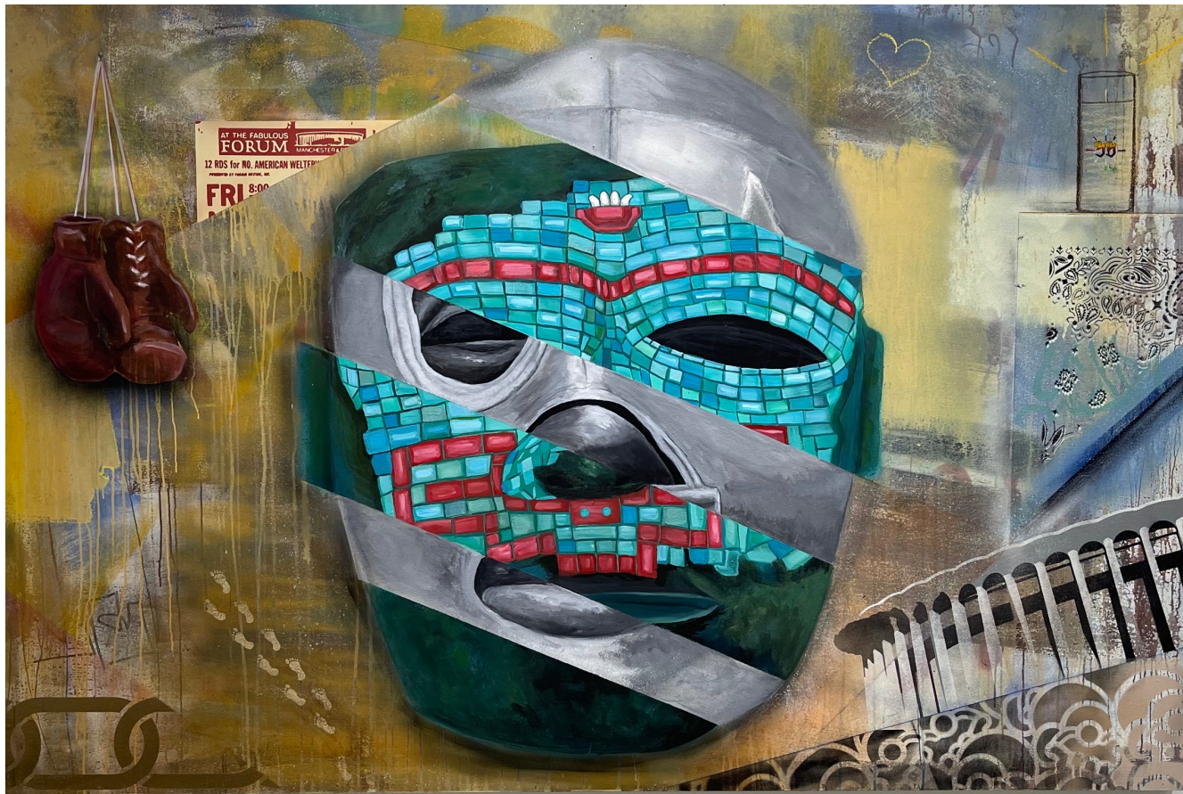
Bueno, Bonito, Barrato 2 , 2021