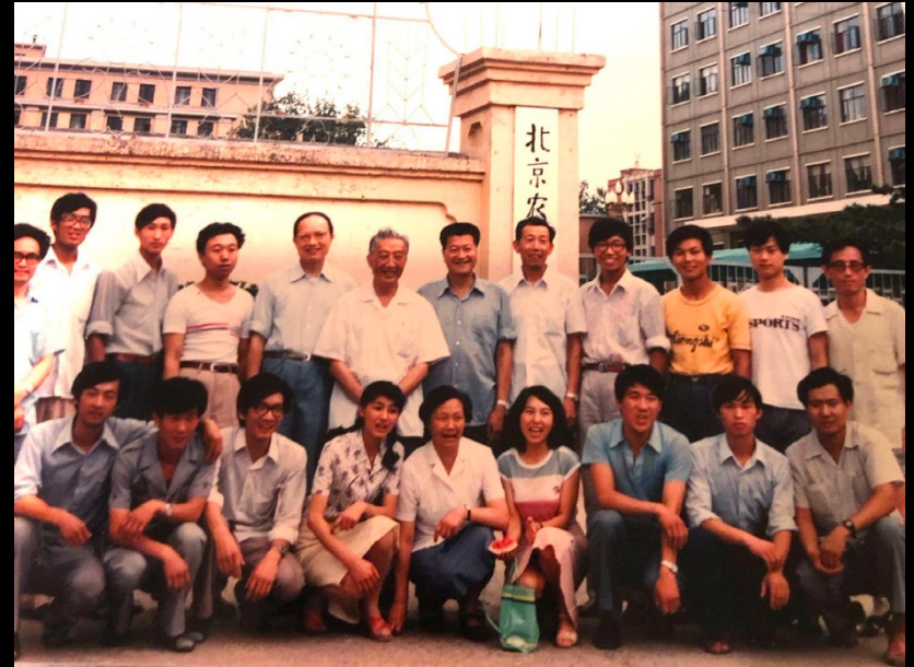
My Mother and father and their classmates and professors, Chinese Agricultural University, Beijing, 1989