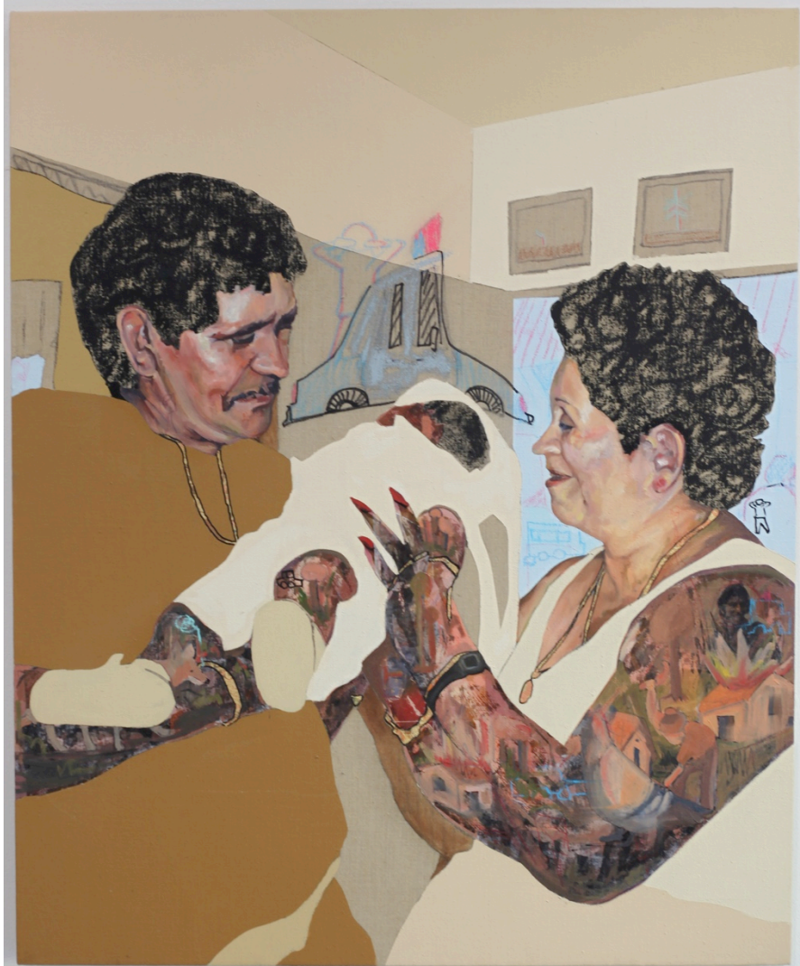
Passed on to Him 2020 Mixed media on Linen 36x44in