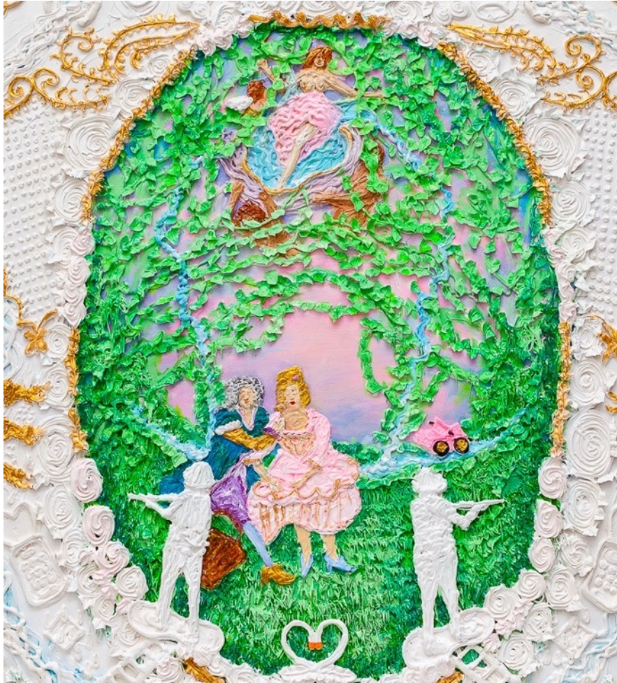
American Urn, (After Madame Victoire vases at Chateau de Versailles,)