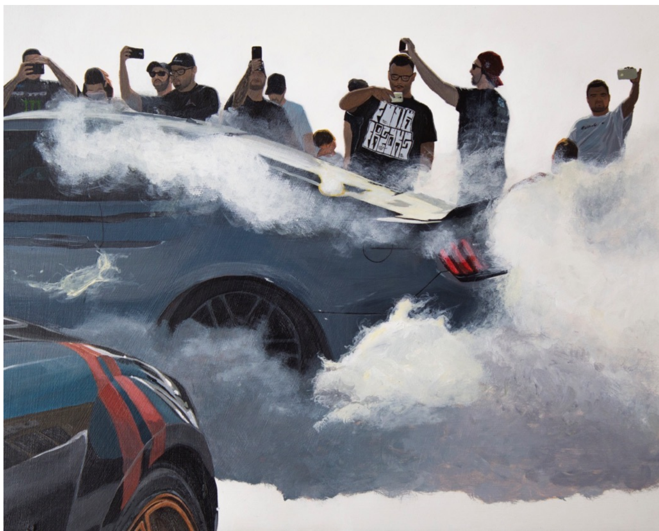
Black Sunshine 2017 Acrylic on Wood Panel 20x16in