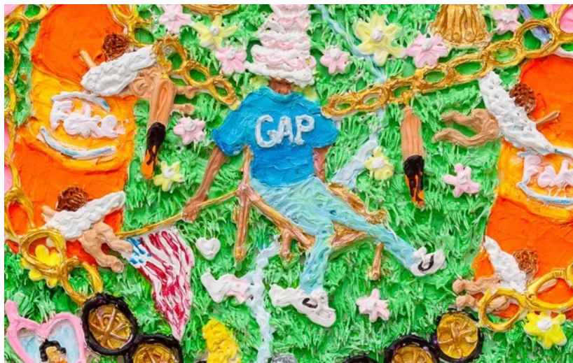
Homeland Promised Land Detail